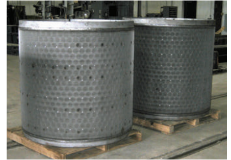
Intercept valve coarse-mesh screens replaced and ready-to-ship.