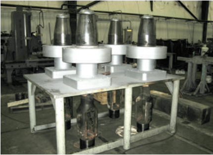
CV's assembled and coated with high temperature paint on non-steampath surfaces.