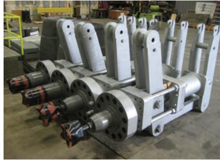
Restored control valves assembled and ready for shipment.