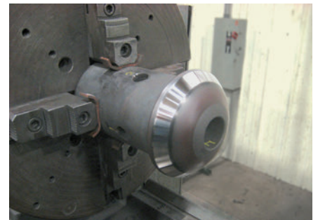
Valve disc following grinding and polishing.