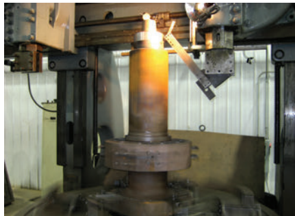
Truing cut being performed on stand for new balance chamber on control valve.