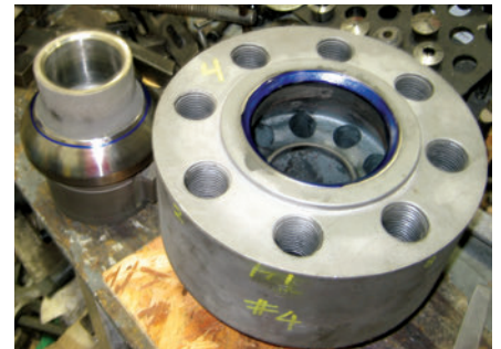
Successful blue check of MSV bypass valve and main disc.