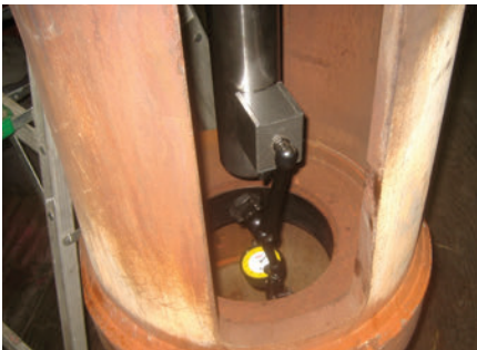
CV crosshead bushing sweep to assure concentricity following corrective action.